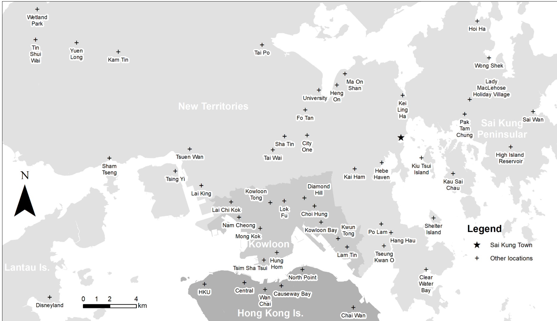
Figure B2: Transport End Terminals That Link to Sai Kung Town.