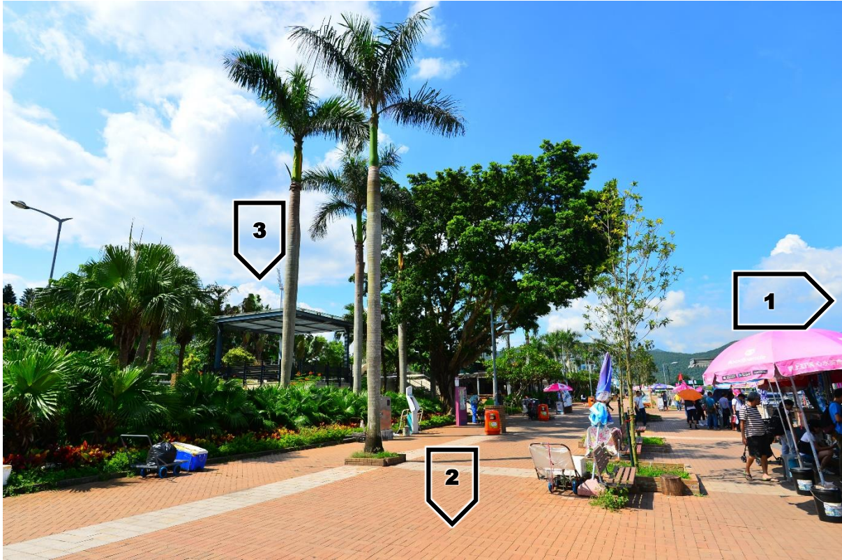
Figure B4: Fieldwork Station ST3. 1: Sai Kung Public Pier; 2: Promenade; 3: ST3 under the cyan metal pavilion with glass ceiling. Walk up stairs to get to it.